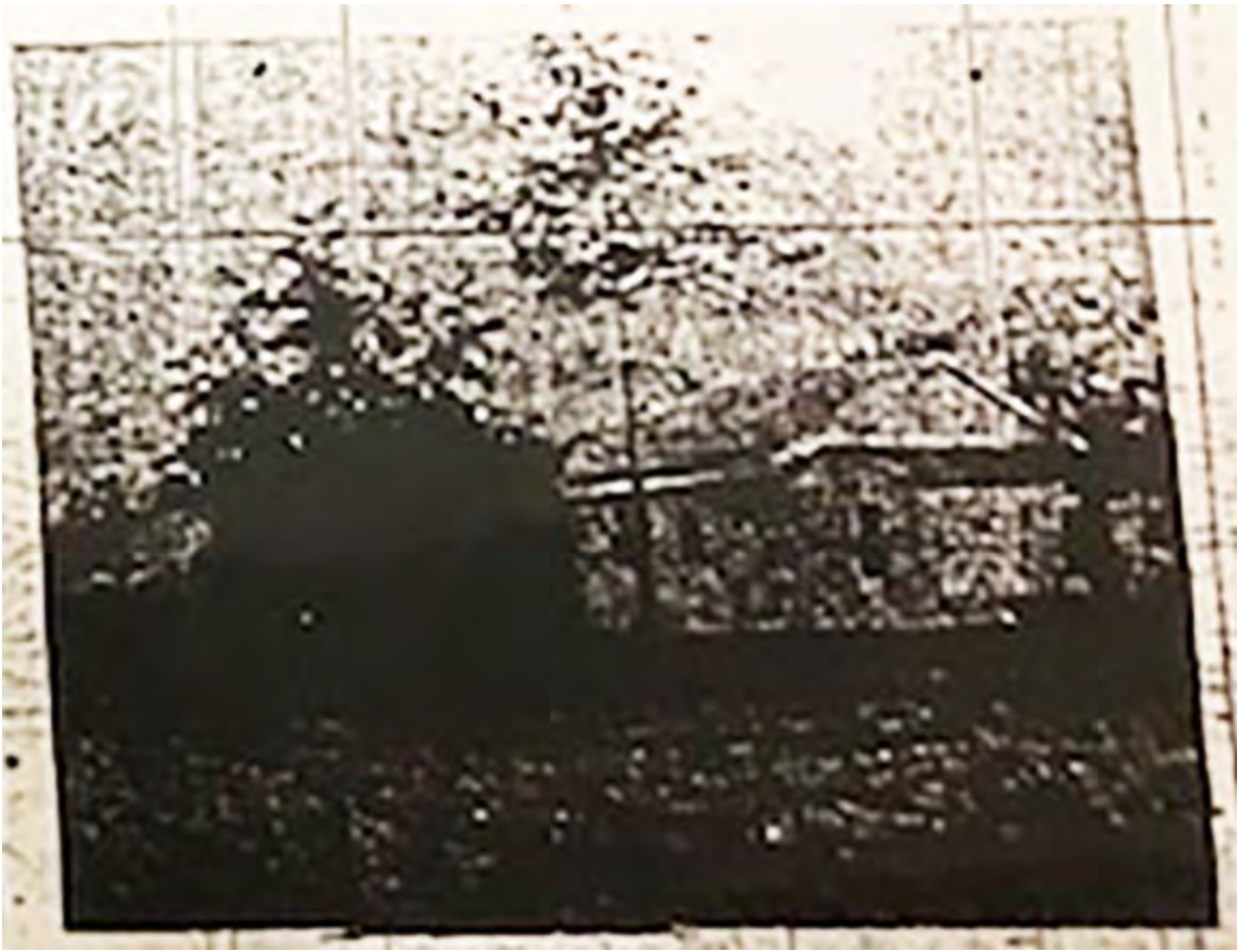
Dining Hall in 1955