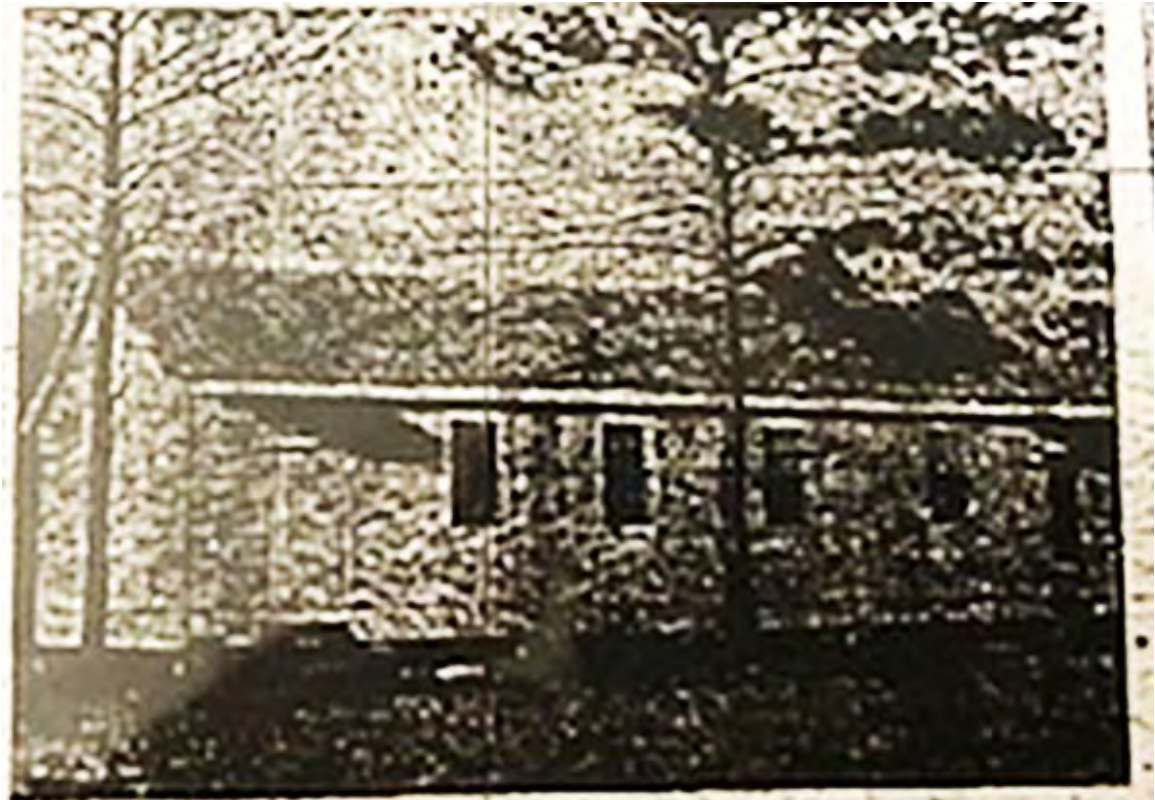
Barracks in 1955