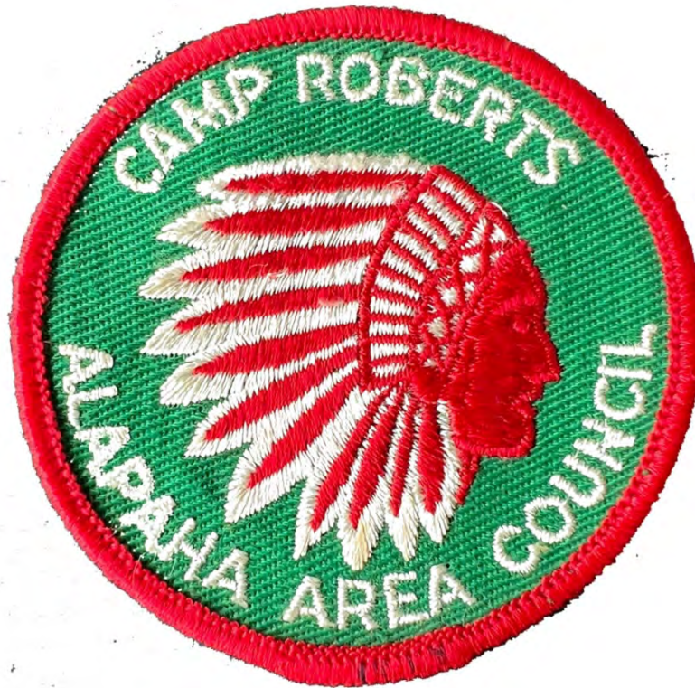
The only know patch from Camp Roberts

Camp Roberts was the Alapaha Area Council camp prior to the opening of Camp Patten in the mid-1960s.