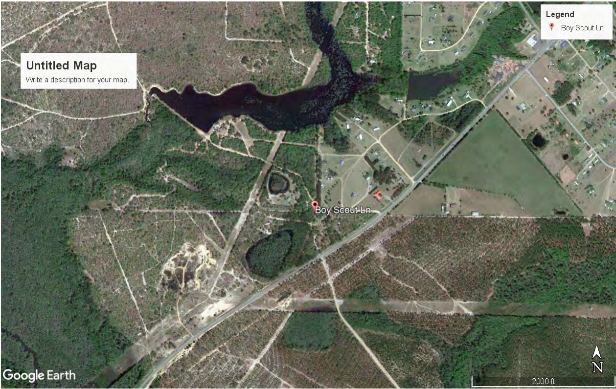
Google map of Camp Robert in 2021 (Exact boundaries are unknown)