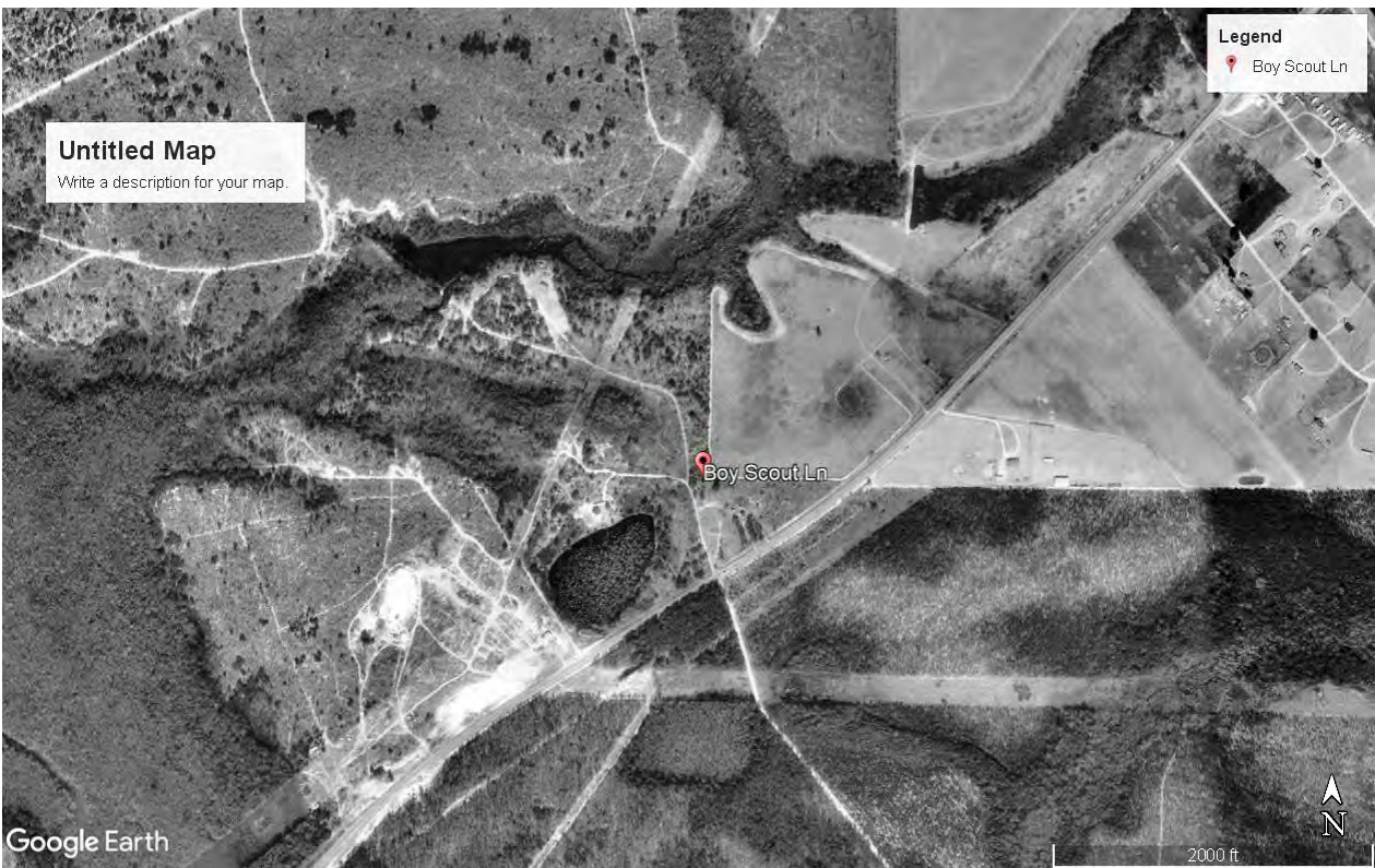
Google map of Camp Robert in 1993 (Exact boundaries are unknown)