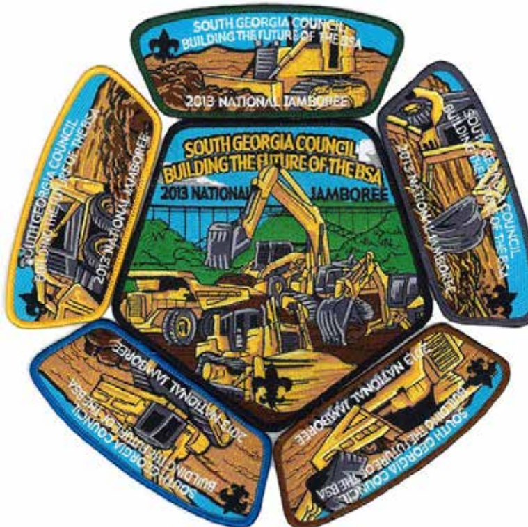
2013 JSP and Center Piece