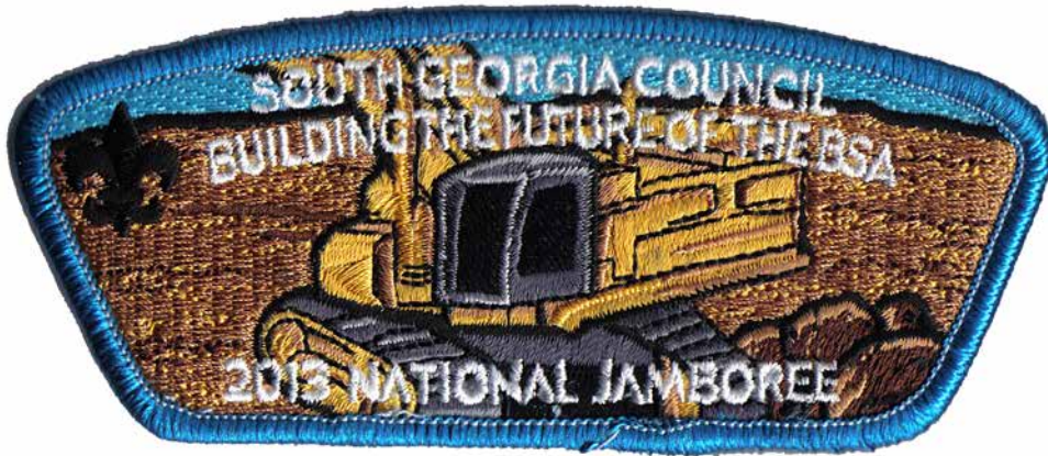
2013 JSP Troop B133