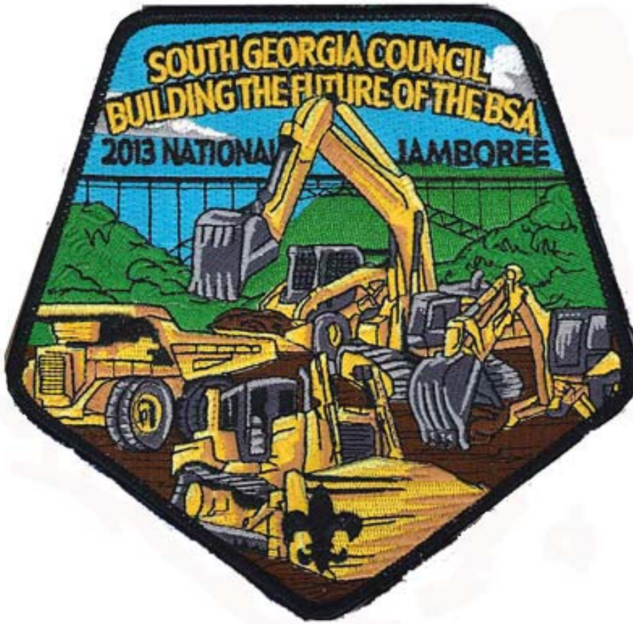
2013 JSP Center Piece