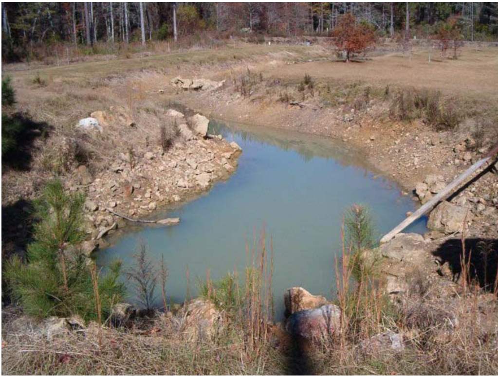
Jasmine Springs and branch that runs to the Blue Hole (The same camera position as the 1946 photo above, which is shown again below for comparison)