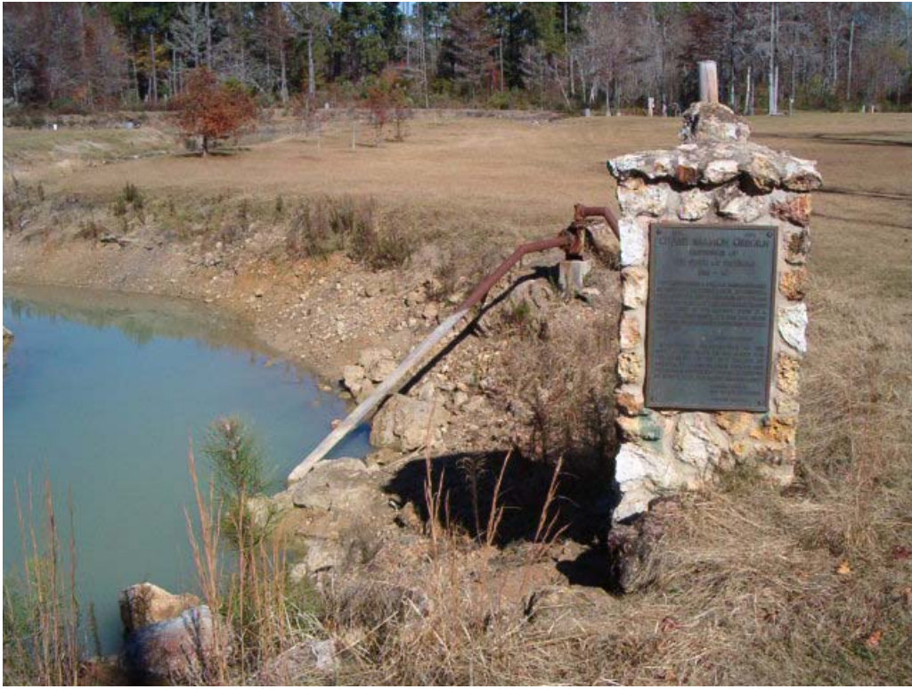
Jasmine Springs Monument