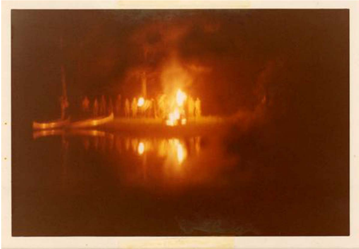
A night photo of the Blue Hole in 1971 at an OA tap-out. The photographer was standing where the audience was seated which was between the pool and the Blue Hole looking across the Blue Hole to the where the candidates were taken to be marched off into the woods.