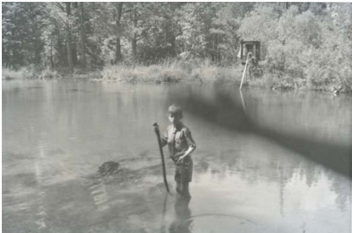
The Blue Hole in 1970 or 1971.