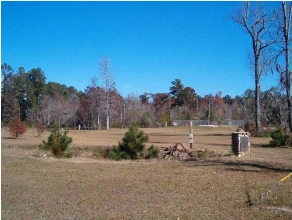
Jasmine Spring (looking from trading post to the northeast toward the pool)

In 1999, a tornado struck Camp Osborn and took out most all of the big trees around Jasmine Spring and the Blue Hole. From 2000 until 2002 a sever drought caused Jasmine Springs (an artesian well) to complete dry up. After the drought broke beavers dammed up Mill Creek so bad than when it rained the main part of camp would flood. To solve the flooding problem, Worth County came in and cleared out the channel and did drainage work around the Blue Hole and Mill Creek at the main camp. From 2002 until 2009 the spring did not flow but was full due to water backup from the Blue Hole. It was 2010 before the spring began flowing clear water again. The photos below show the results of those 5 years.