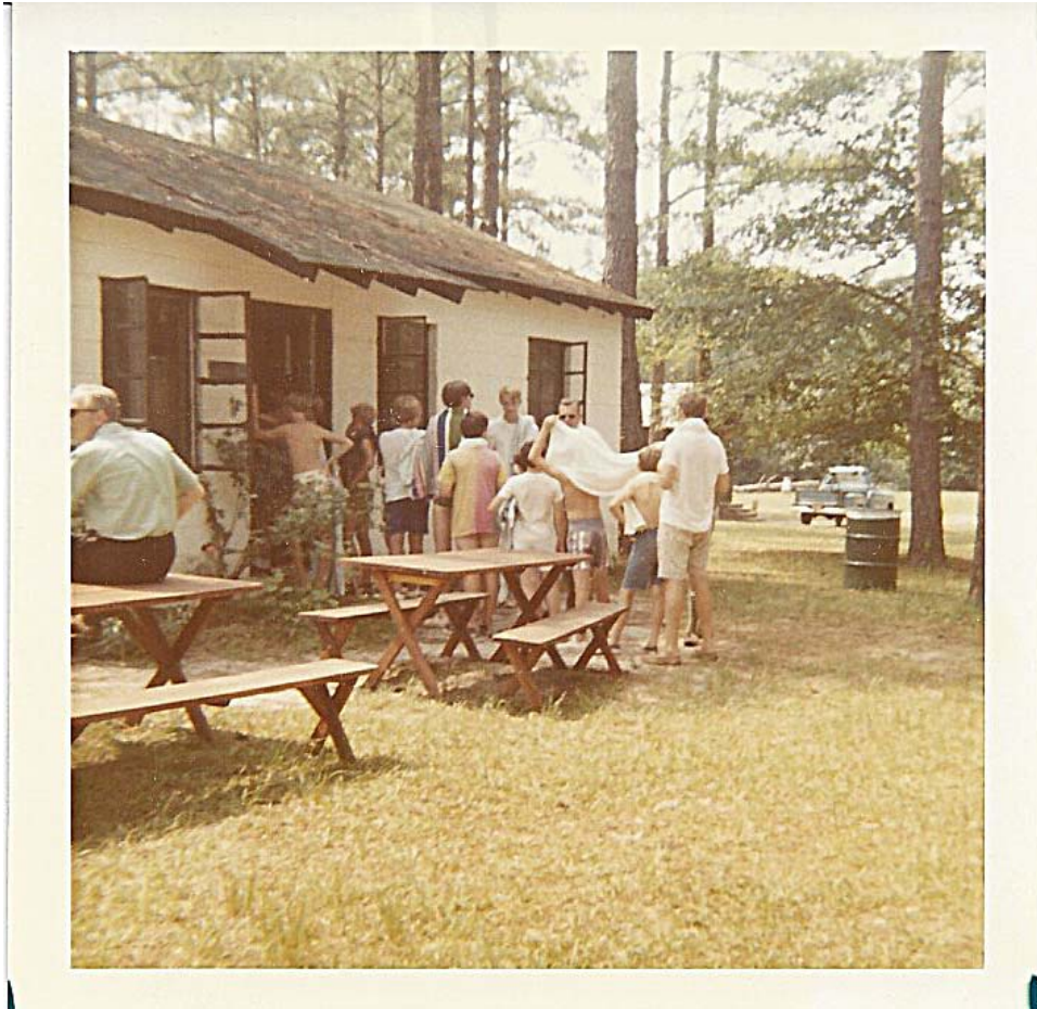
First Aid Building in the 1970s