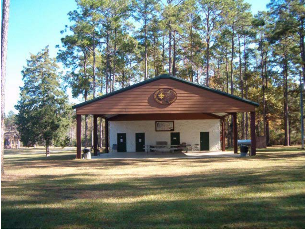
The Eagle Pavilion is located behind the Administrative Building in the location of the original dining hall.