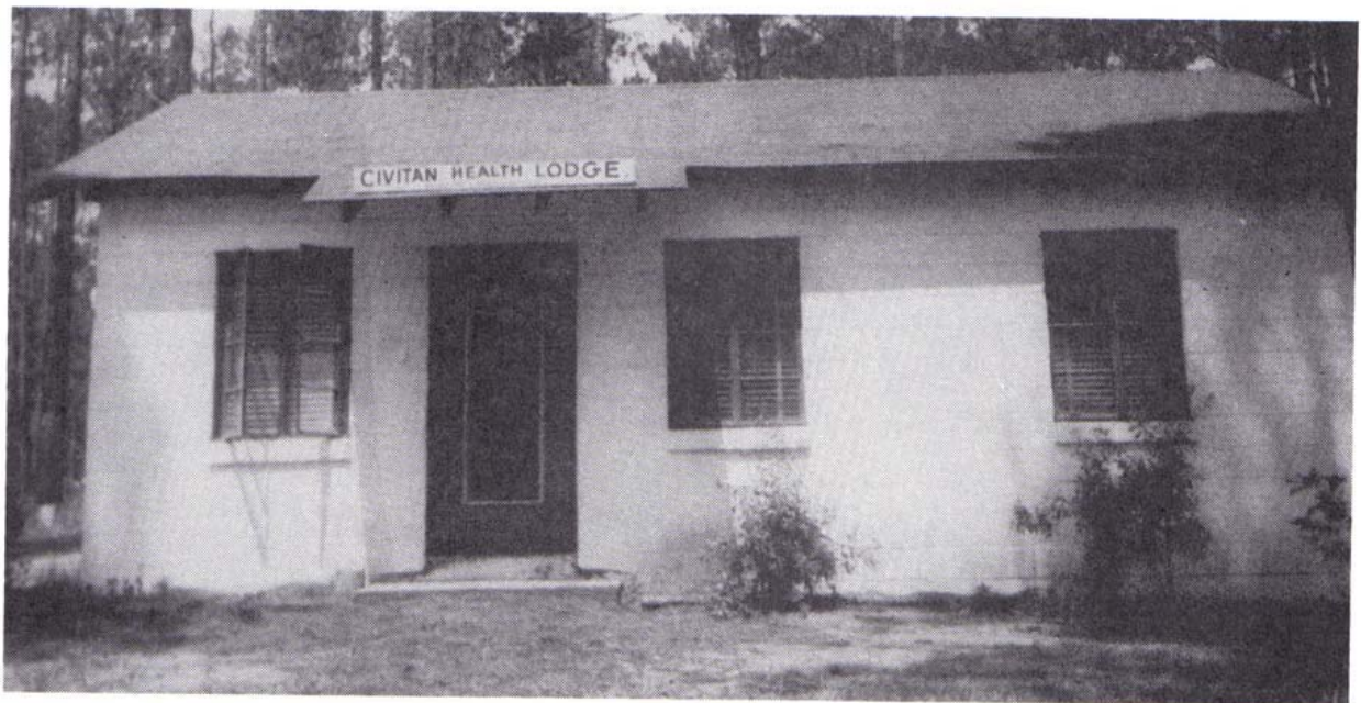
First Aid Building in the 1950s