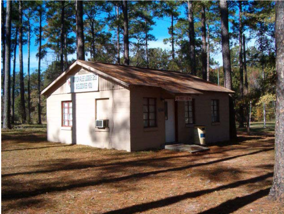
First Aid Building in 2007 (above) and in the 1950s (below).