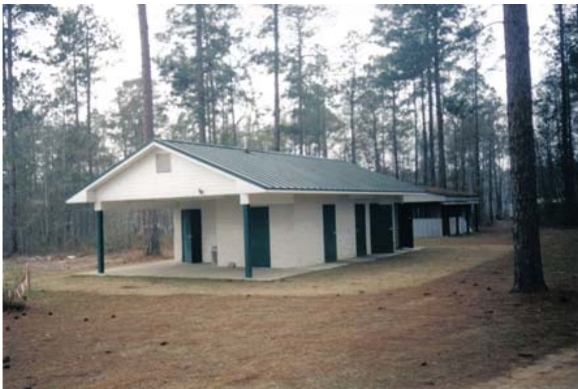
Bathrooms built on the ridge. The building contained 8 private bath/shower unites. Constructed in 2000. An identical building was built in the main camp near the shooting range.