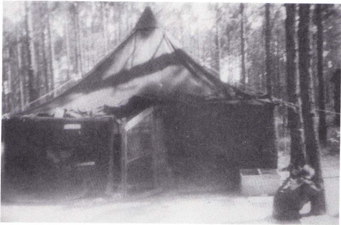
Stewart's Tent located near the original dining hall. Photo from 1952.