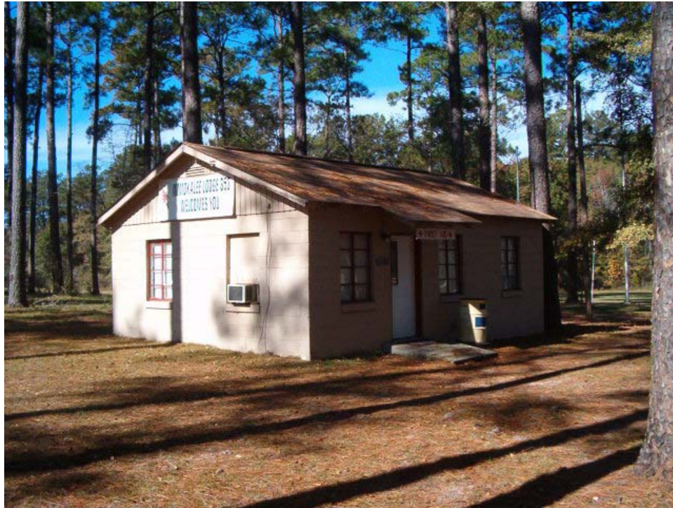
First Aid Building in 2007